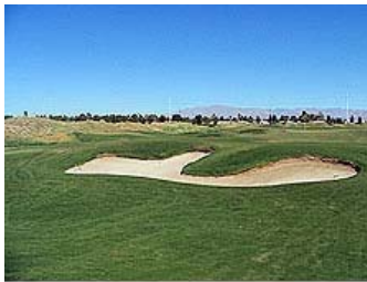
A zoning change could spell doom for Royal Links Golf Club, huge profits for Walters Golf.

(July 13, 2005) - In his latest story for AmericanMafia.com, " Par for the course: Sweetheart land deal expected to pass under the radar - again. " former Las Vegas City Councilman Steve Miller reports how Walters Golf owner Billy Walters stands to make a fortune at the expense of Las Vegas taxpayers. If a pending redistricting deal goes through, the value of land that Walters bought from the city in 1999 for $5,600 per acre would balloon to $300,000-$400,000 per acre, Miller writes, adding that it would also result in the razing of Royal Links Golf Club .